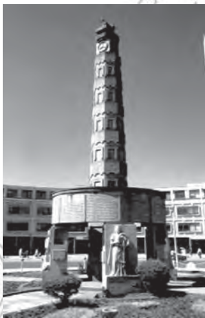
Victory Monument in Arat Kilo — a sign of our ability to defend the motherland

You should have clear knowledge about the past because it helps you to understand the present situation in a better way. When you go back in time, you understand that Ethiopian history is full of stories of wars and conflicts. Ethiopians fought many battles against external enemies in order to defend their country. This is what we have to do today, and in the future when enemies invade our country. This is our obligation as citizens.