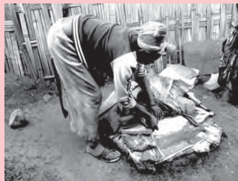
Dorze woman processing enset

Discuss the following points as a class.