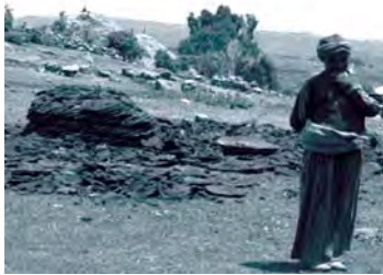
Woman preparing dung on the farm

Women's contributions increase when they have equal access to education, job opportunities, and political and economic participation. When women get more education and training they can help their family in many ways. Educated women