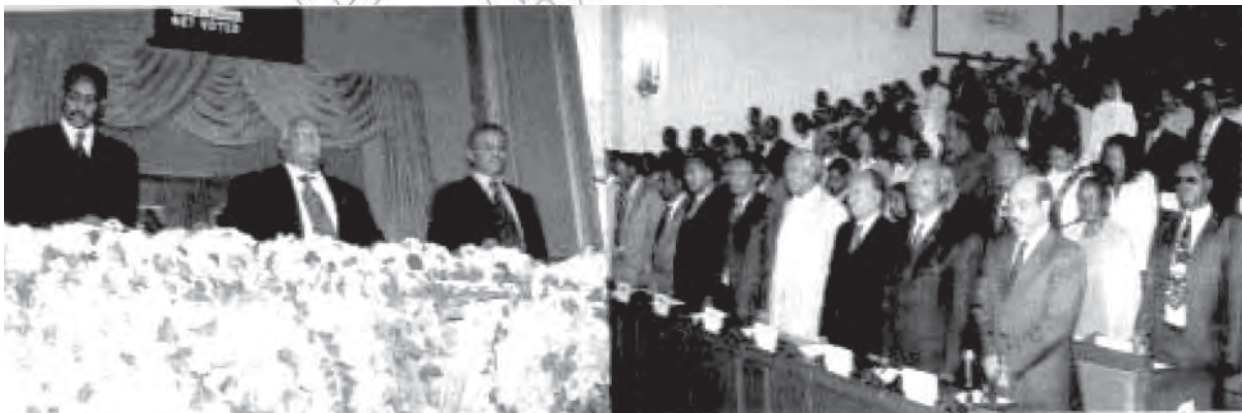
Joint meeting of the House of Federation and the House of Peoples' Representatives