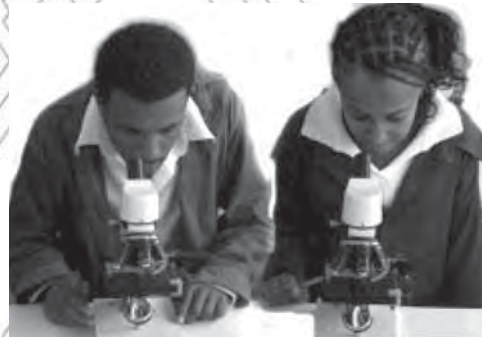
Gender and cultural equality are respected under the Constitution